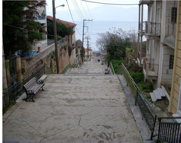
The 172 stone stairs connect up town with down town and the historic center