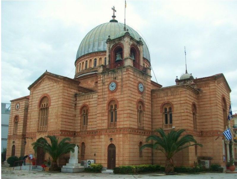
The imposing and biggest temple of the city, Panagia Faneromeni is the metropolitan temple, work of Ernst Ziller